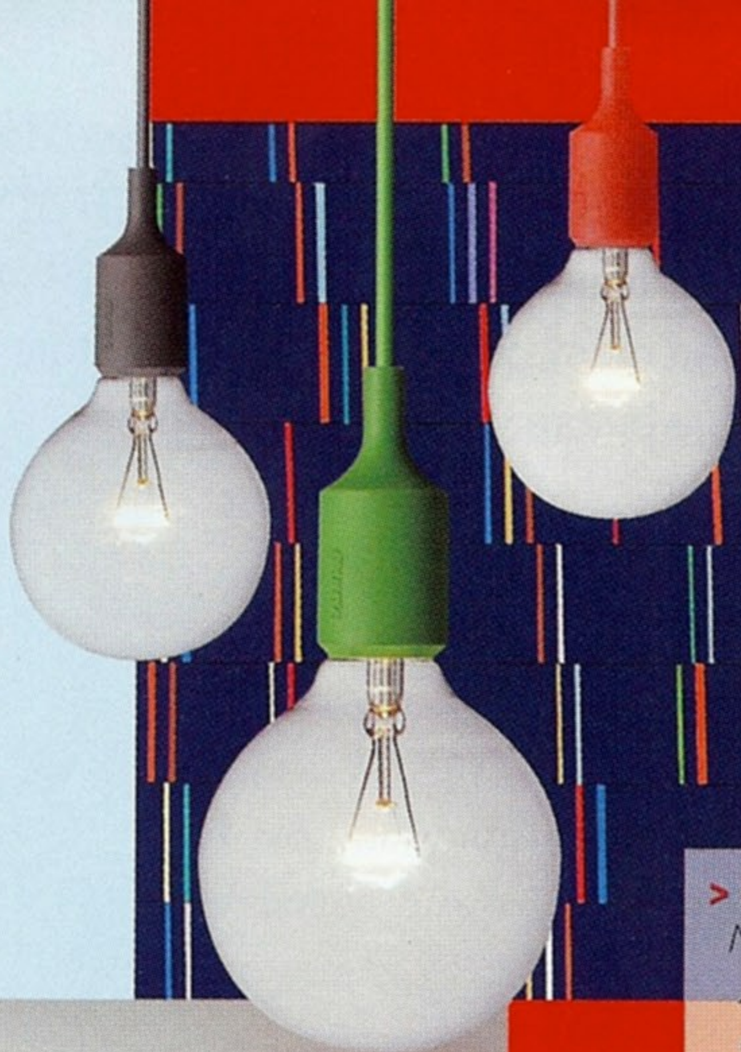
> HANG TIME DESIGN WITHIN REACH The E27 Pendant light, $99 each, dwr.com .