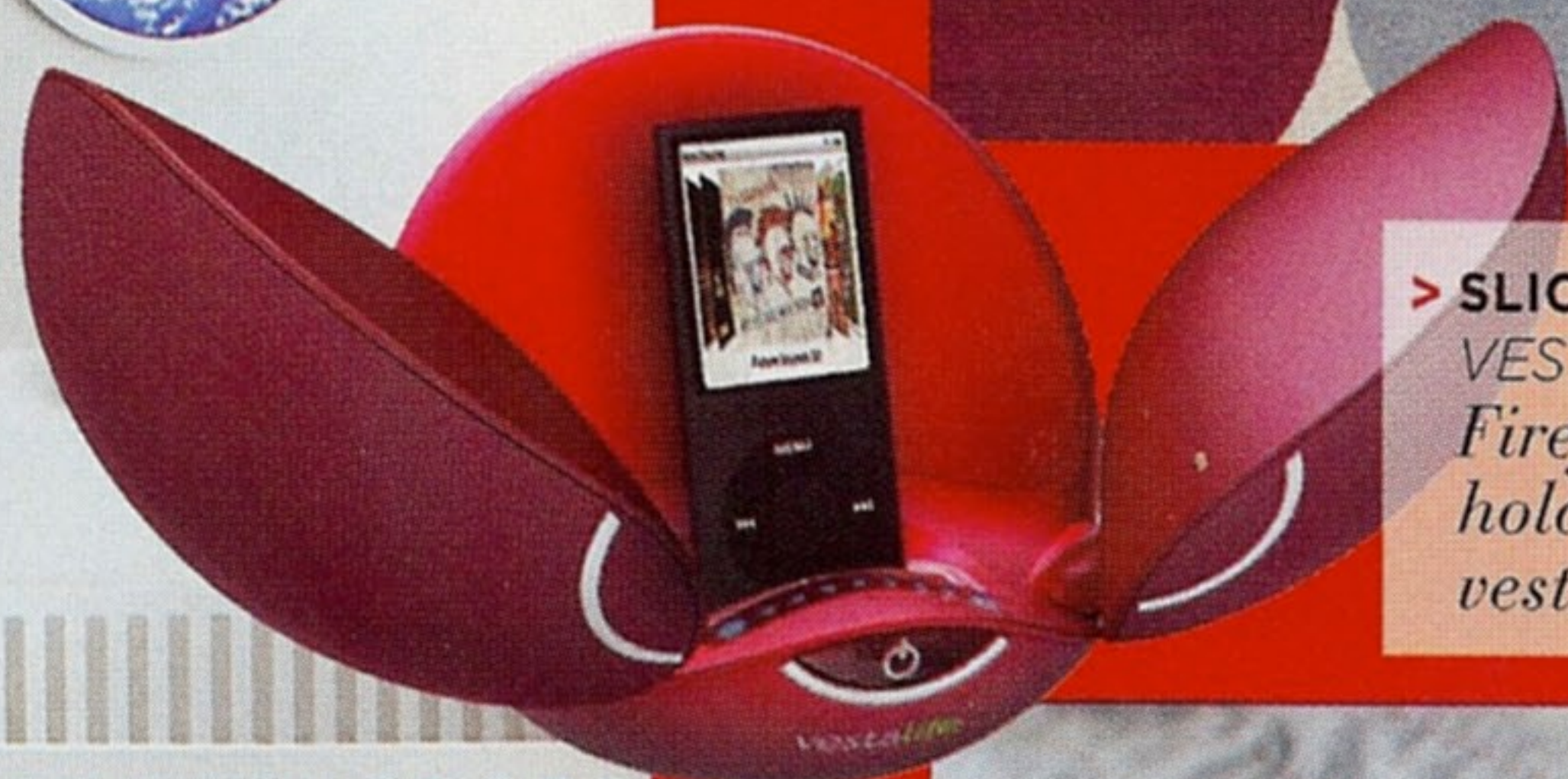
> SLICK SPEAKER VESTALIFE Firefly Nano holder, $130, vesta-life.com .