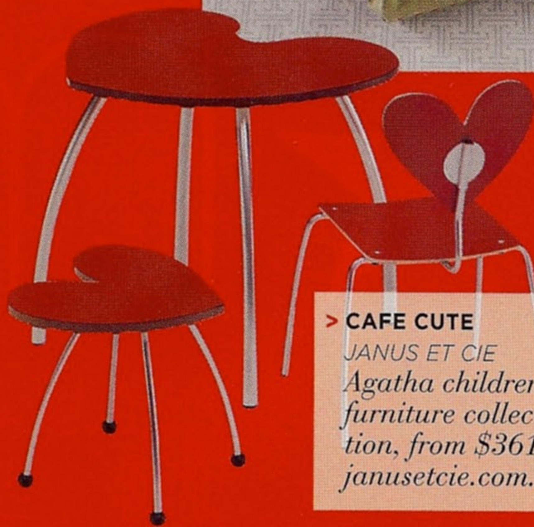
> CAFE CUTE JANUS ET CIE Agatha children's furniture collection, from $361, janusetcie.com .