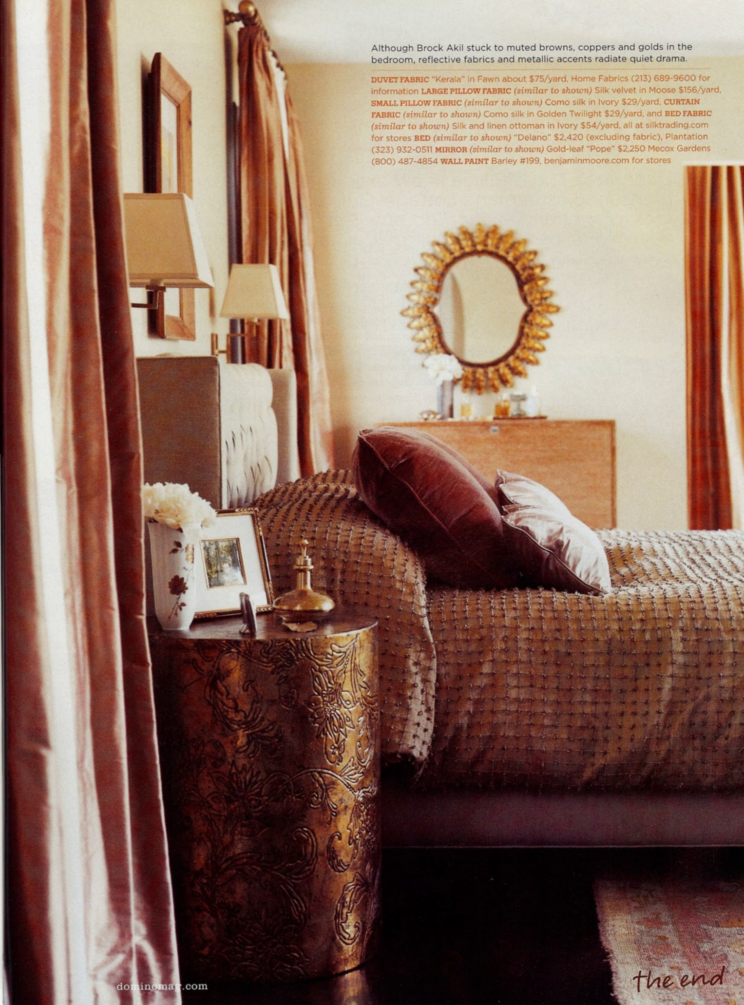
DUVET FABRIC “Kerala” in Fawn about $75/yard, Home Fabrics (213) 689-9600 for information LARGE PILLOW FABRIC (similar to shown) Silk velvet in Moose $156/yard, SMALL PILLOW FABRIC (similar to shown) Como silk in Ivory $29/yard, CURTAIN FABRIC (similar to shown) Como silk in Golden Twilight $29/yard, and BED FABRIC (similar to shown) Silk and linen ottoman in Ivory $54/yard, all at silktrading.com for stores BED (similar to shown) “Delano” $2,420 (excluding fabric), Plantation (323) 932-0511 MIRROR (similar to shown) Gold-leaf “Pope” $2,250 Mecox Gardens (800) 487-4854 WALL PAINT Barley #199, benjaminmoore.com for stores

Although Brock Akil stuck to muted browns, coppers and golds in the bedroom, reflective fabrics and metallic accents radiate quiet drama.