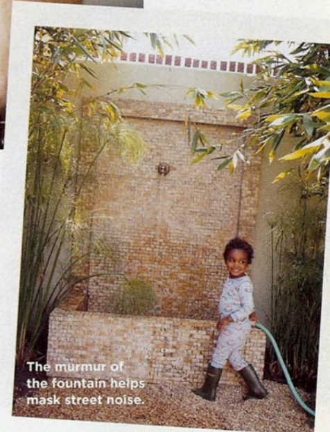
The murmur of the fountain helps mask street noise.

“When you walk into our home, you can see right through to the garden, which is very simple. Trips to Italy and Morocco inspired how we want that area to feel—it’s all about being outside and enjoying each other’s company.”