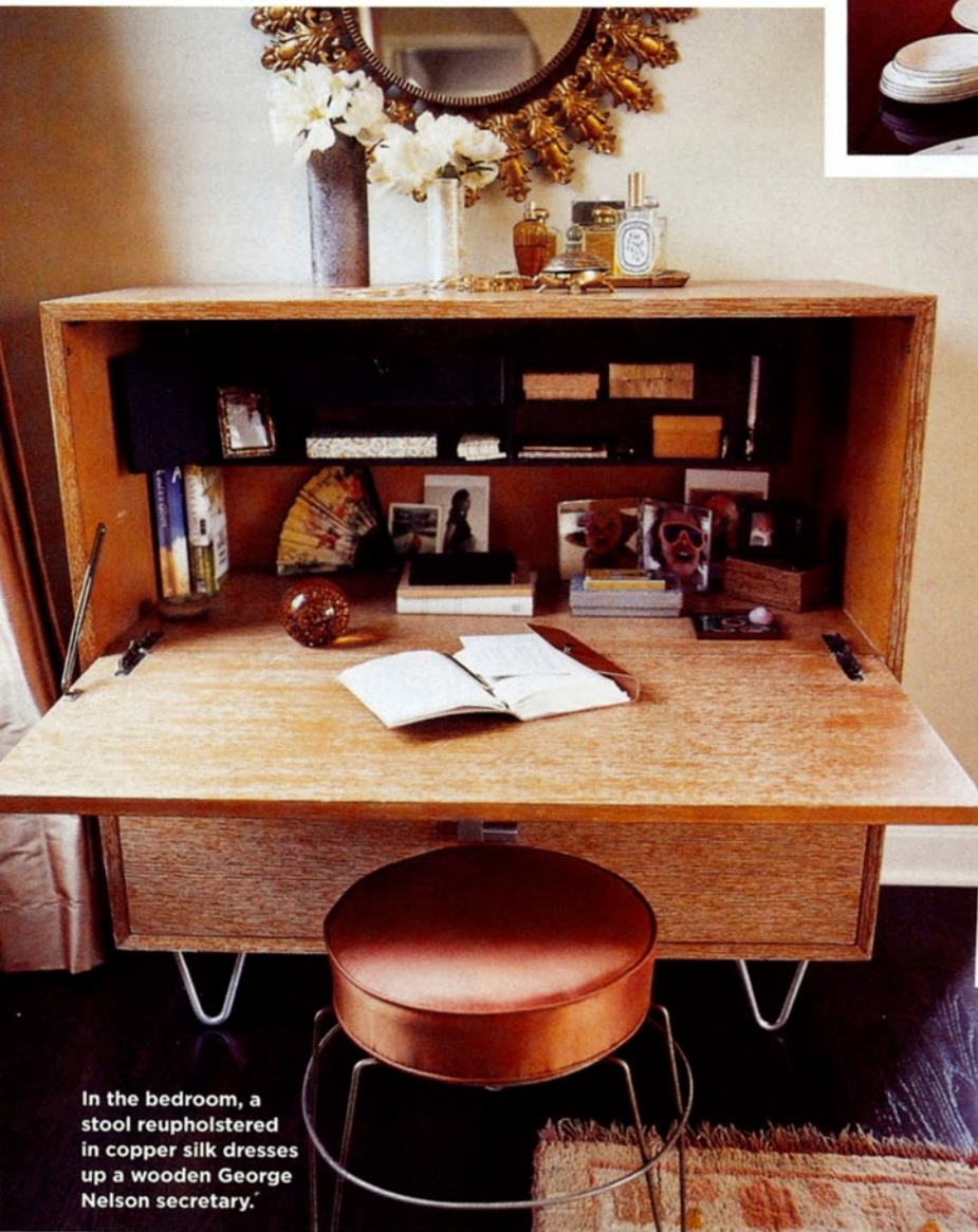
In the bedroom, a stool reupholstered in copper silk dresses up a wooden George Nelson secretary.