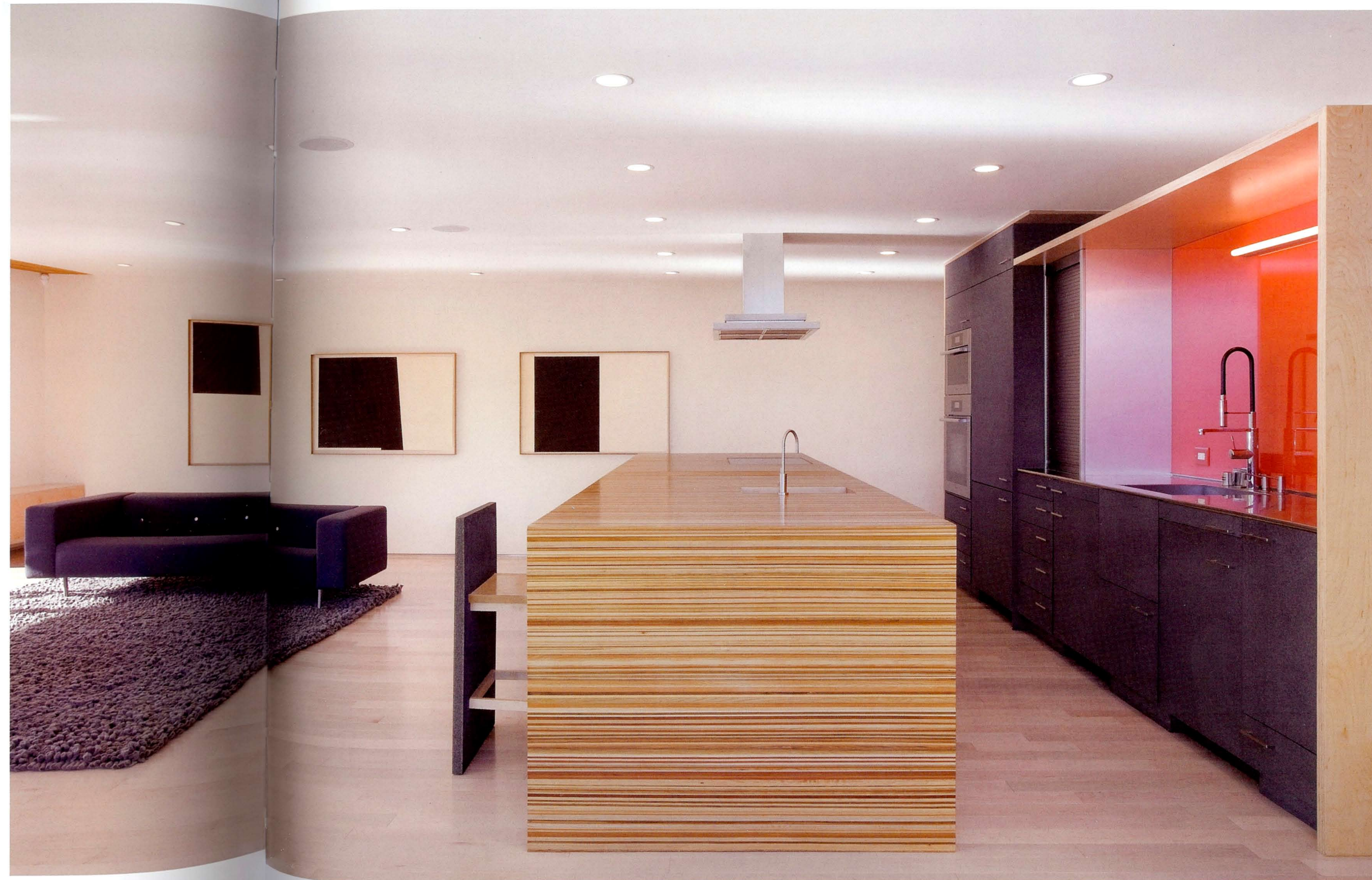
above master bathroom with custom-built sink installation constructed of recycled rubber right the cube-like kitchen island incorporates built-in chairs