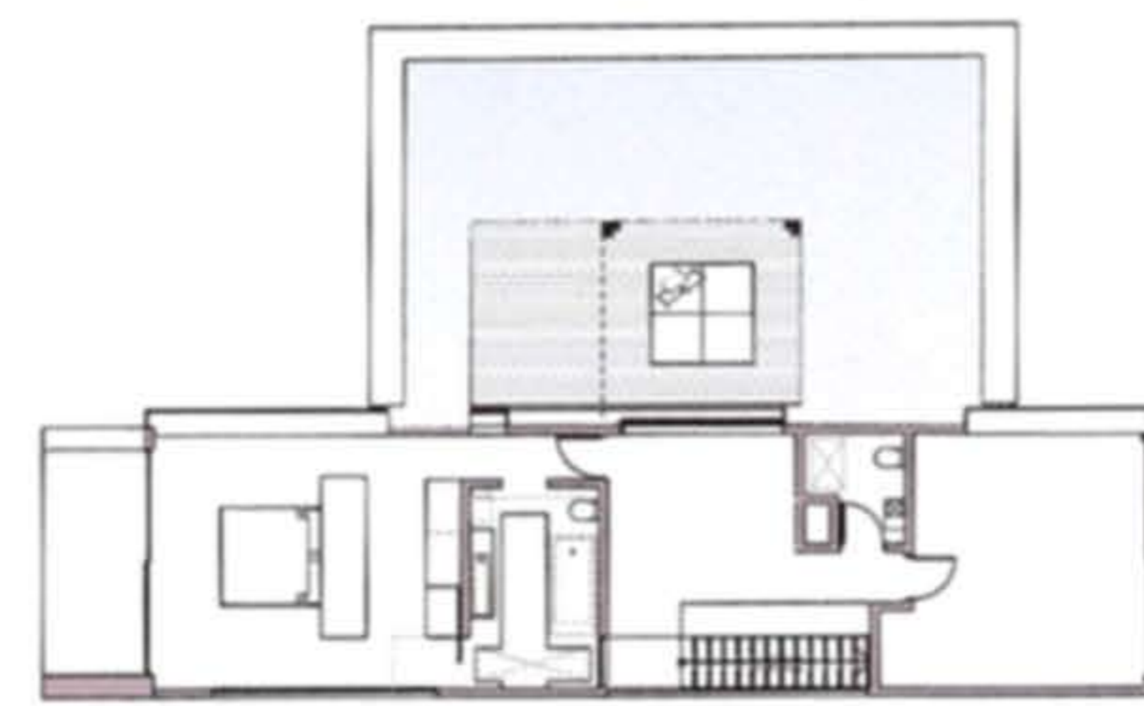
second floor plan