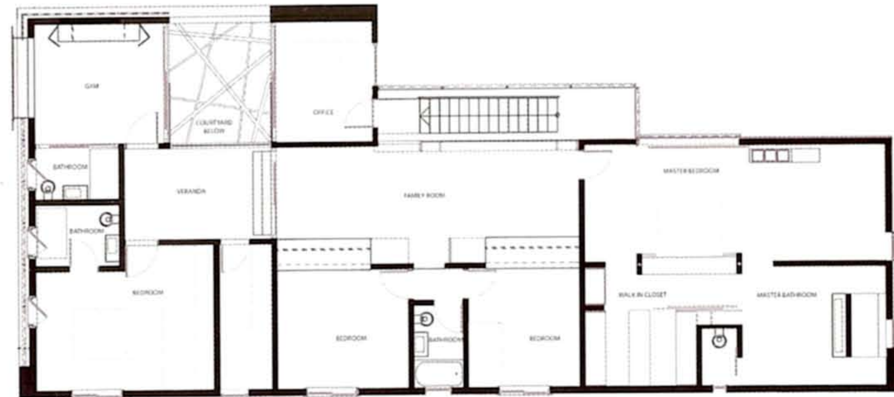
second floor plan